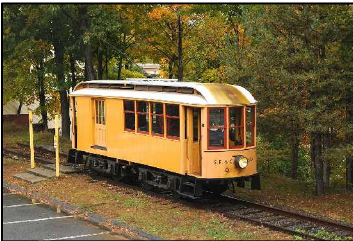
An unusual view of No. 10 Just leaving Salmon Falls.