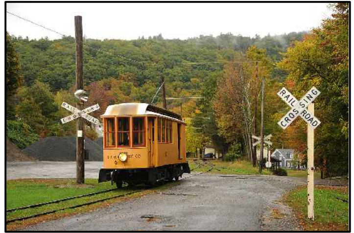
No. 10 Navigates a sea of crossbucks.