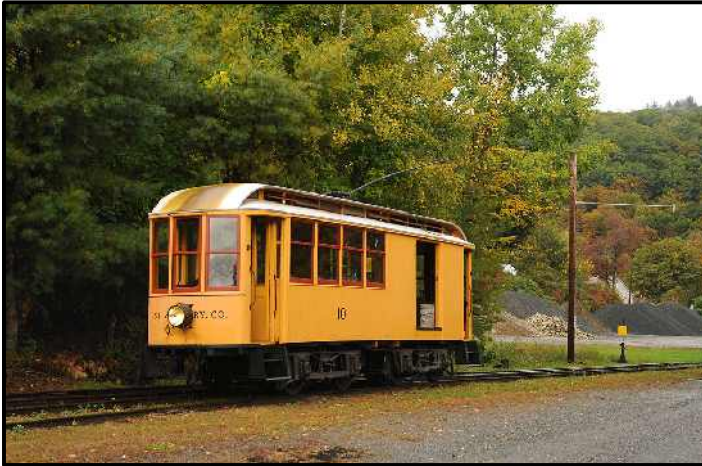
No. 10 Hustling home.