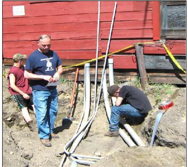
Vocational Technical School would-be electricians installing underground wiring as part of site preparation for the carbarn project.