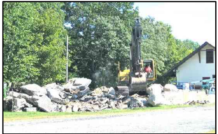
Back at the Front.....

When the permit was issued, and the big backhoe came back to the milk house dock, the dust really began to fly. Big slabs were piled up for possible future use at SFTM, and the core of the building turned out to be a coarse sand which turned out to be just perfect for backfilling the carbarn foundation. A real two-fer, one might say.