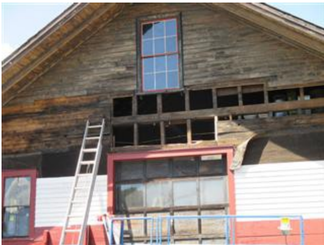
Off with the old, on with the new Freight House clapboards.