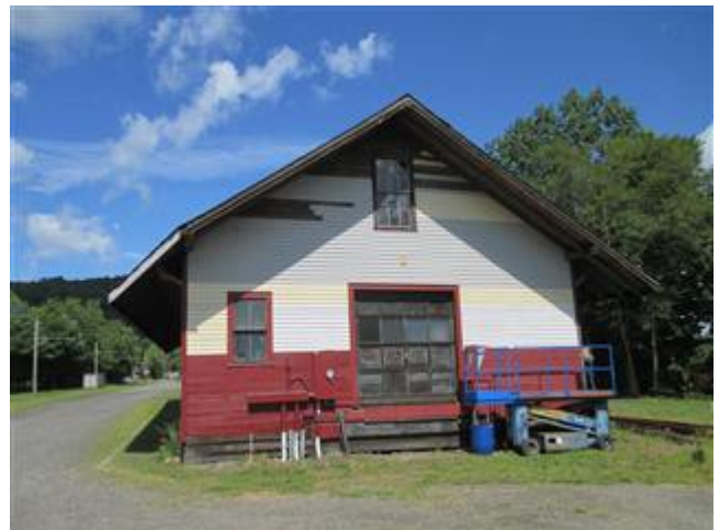
The variously-primed clapboards of the Freight House. Paint is next.

Freight House – We hired (thanks to the H. Albert Webb Award) a contractor to replace the missing and deteriorated clapboards on the east end of the Freight House. Since the new clapboards were pre-primed at various times they are several different colors. We tried to save some of the original(?) clapboards as well, so right now that end looks a bit odd, but better than it did before. It is waiting for YOU to volunteer to finish scraping the old clapboards and paint the whole end Cream. There is also more clapboard work, easily reached from the dock, on the north side, if you want to do that. We plan to hire work on the slate roof this winter.