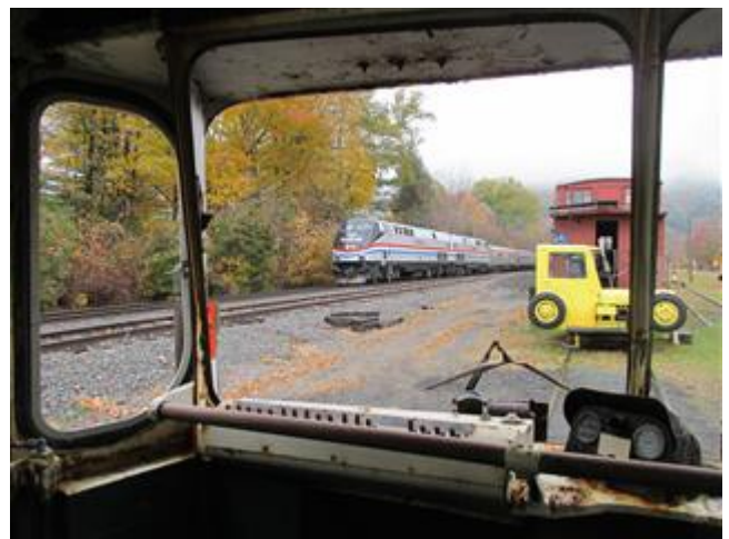
The Amtrak Fall Foliage Special passed by the museum four times this fall. Seen here from inside PCC MBTA 3321.