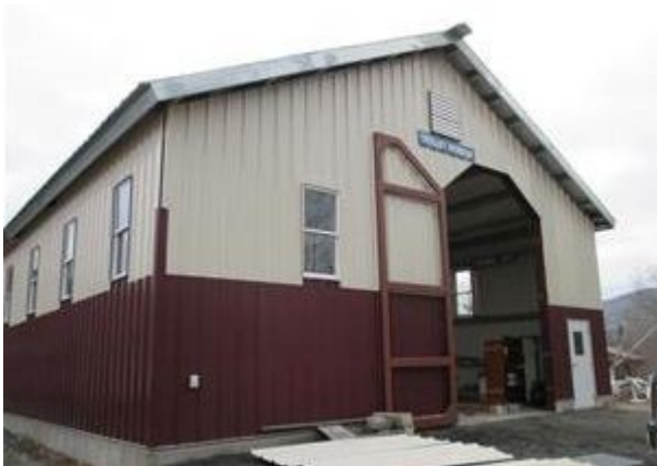
The sheathing is on the east end of the New Car Barn.

If your address label does not say '2016' or '2100' please renew your Membership today. You can visit our FaceBook page at https://www.facebook.com/ShelburneFallsTrolleyMuseum/ Be sure to visit us at the Big Railroad Hobby Show January 30 and 31, 2016 http://railroadhobbyshow.com/