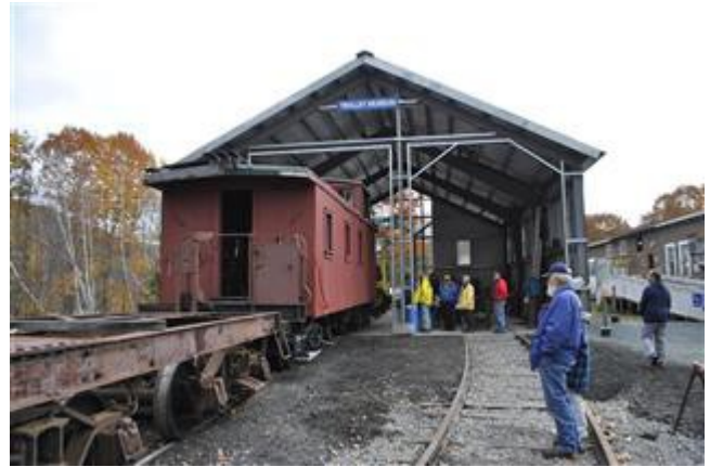
The first train into the New Car Barn, on Volunteer Appreciation Day. CV 4015 and the flat car enter Stall 1 of the New Car Barn, hauled by the Trackmobile.

Web – You can now renew your Membership or make an additional donation online at http://www.sftm.org/join.shtml