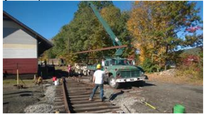
UMass Civil Engineering students help place the last rail in the New Car Barn tracks

Members of the UMass Civil Engineering Club visited twice recently to provide some young backs for trackwork, in exchange for some hands-on experience building railroad track. They learned about placing ties and tie plates, placing rails with the boom truck, spiking rails to ties, gauging track, bending rail with a come-along or rail bender and tamping ties. We all appreciated their energy, enthusiasm and all the work they accomplished.