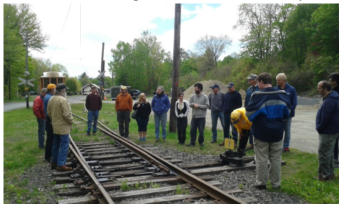
We watch Polly throw Turnout 2 on Training Day while learning the finer points of turnouts.

Just before we open for the season each year, we