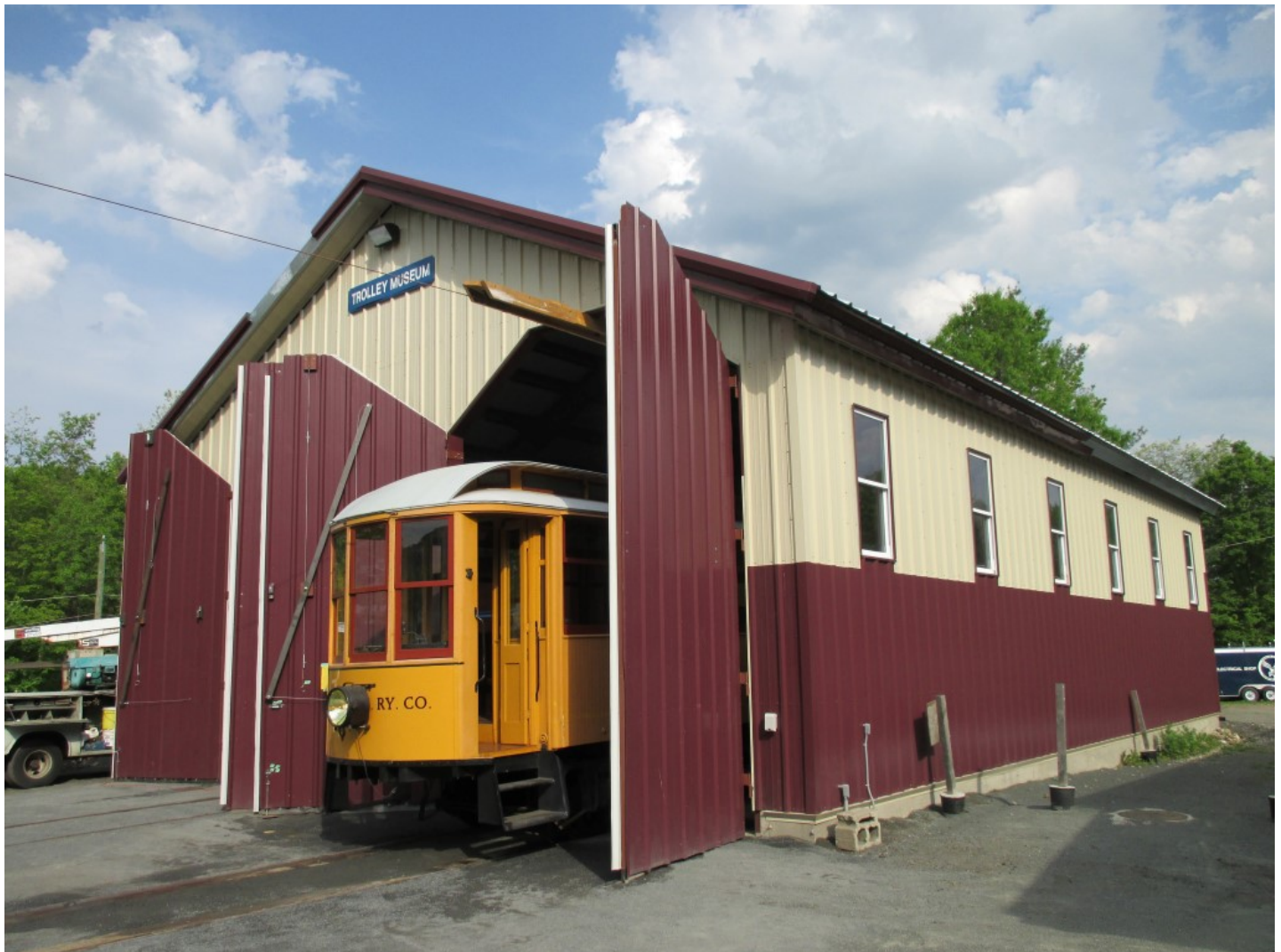
No. 10, freshly washed, pokes her head out of the New Car barn.

DEDICATED TO PRESERVING THE HISTORY OF THE SHELburnE FALLS AND COLRAIN STREET RAILWAY