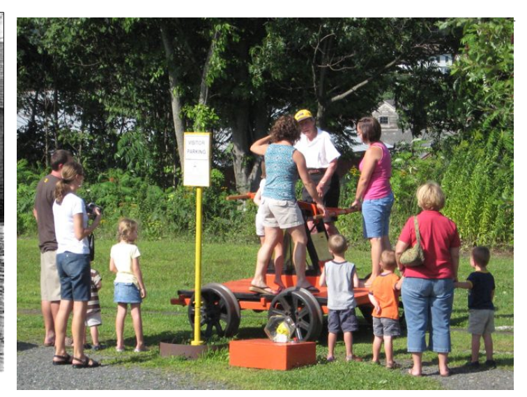
SFTM'S ANSWER TO THE OPEN CAR..... The pumpcar is mobbed on a summer's day.

Passenger traffic is expected to resume at about the time that SFTM's trolley service across the Bridge of Flowers to Colrain does. But don't hold your breath - on either account!