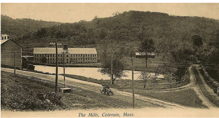
No trolleys here at Willis Place, but note the loading platform next to the track. Milk, maybe?