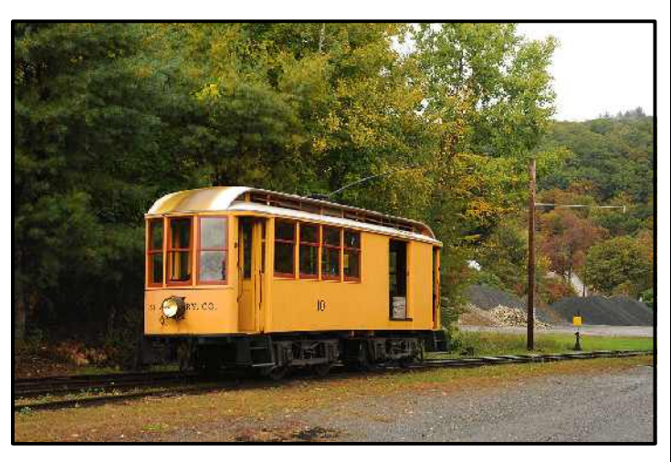
No. 10 Hustling home.

Here are some of the pictures which Marco Moerland sent to SFTM.