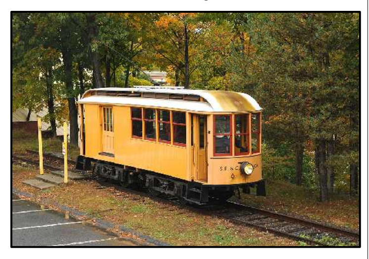
An unusual view of No. 10 Just leaving Salmon Falls.