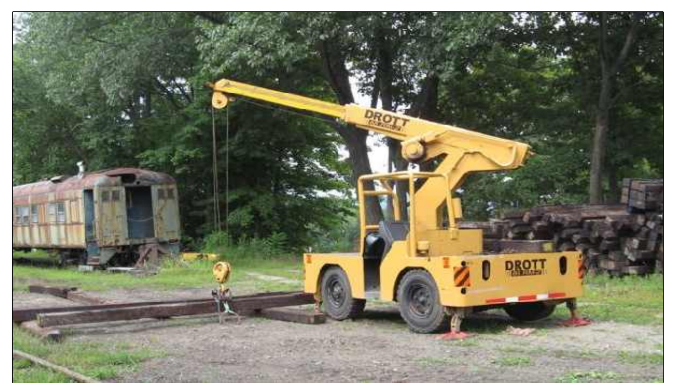
BIG GUN – SFTM's NEW WEAPON AGAINST HEAVY STUFF

Thanks to Sam, SFTM now has the use of this handy machine, which will be enormously useful for moving turnout parts and ties into place, and for erecting the new metal carbarn. The carbarn structure comes in the form of a kit, with all the pieces having to be lifted into place. This machine is ideally suited to such work. It should enable SFTM volunteers to erect most of the building components.