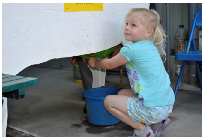
A young visitor tries her hand an milking the 'cow'.

Following the Carbarn ceremony, we held our annual Trolleyfest. We had caboose rides on the House Track and motorcar rides on the South Track. In the new Carbarn we had displays relating to industries and producers from the local trolley era (1896-1927). Hands-on activities included weaving, metal-working, buttermaking, cider-pressing, cow milking and uses of vinegar.