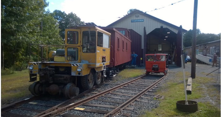
Ted's speeder awaits the next caboose ride departure

Be sure to renew your Membership to help support all our activities, and please donate to our Extend the Car Barn Project at <a href="http://www.sftm.org/grantmatch.shtml">http://www.sftm.org/grantmatch.shtml</a>.