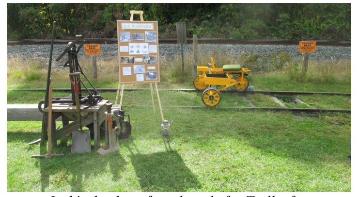
Josh's display of track tools for Trolleyfest