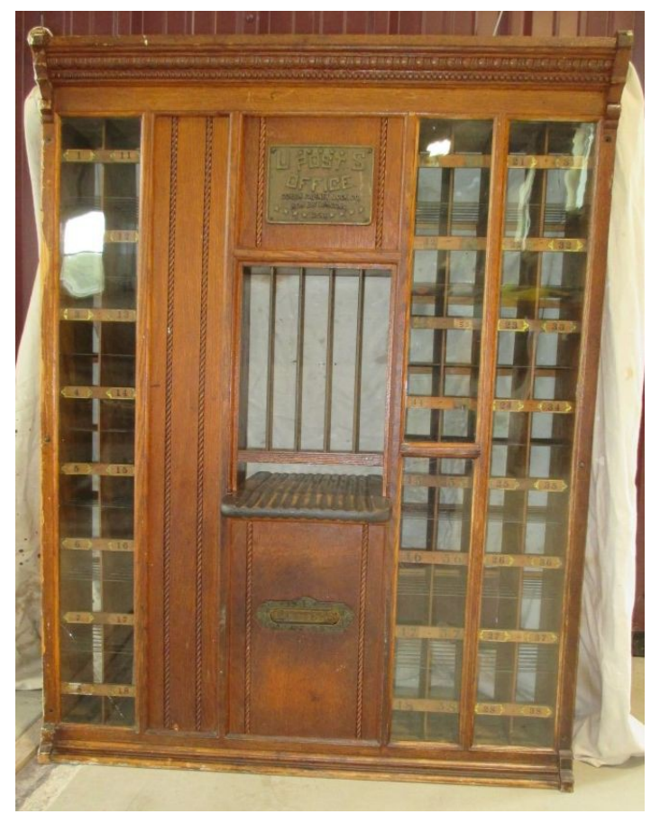
This is the customer side of the Post Office.

The building for Ray's Market still stands and was the home of the storekeeper, Irene Fischlein, until her recent passing. The market and post office closed years ago. You can find remains of the dam, mill and bridge if you look closely.