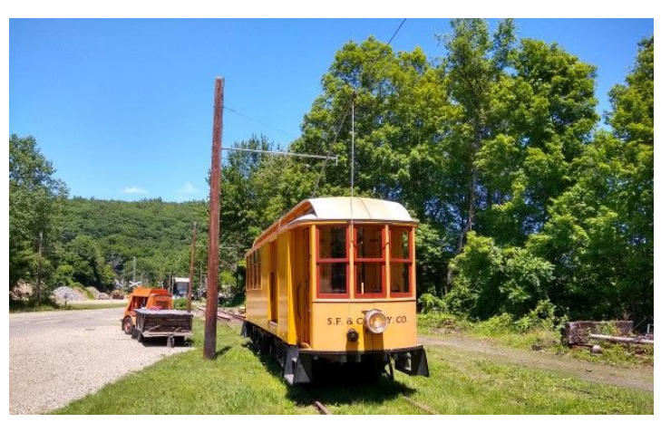
No. 10 pauses to examine the new track work before her first trip of the year.