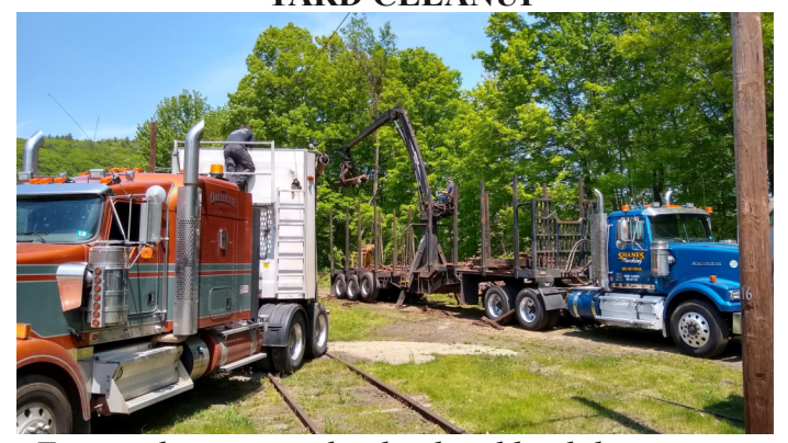
Two trucks were used to load and haul the scrap ties from our yard.

We have used the north edge of our property as a material storage yard, for things like piles of rail, ties and other track material like tie plates and joint bars. Some of this is material we can use, some we are hoping to sell for reuse, some we were saving to sell as scrap, and some was junk that was hard to dispose of.