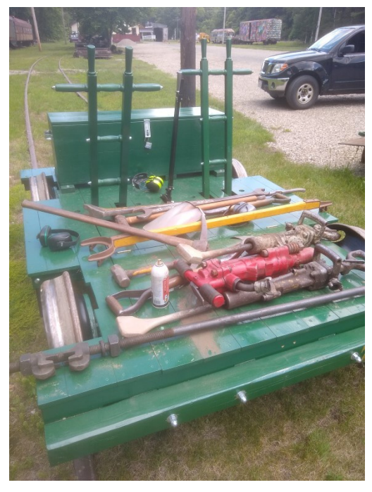
Josh built this handy track car. Here it is being put to use hauling our heavy track tools.