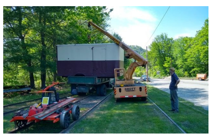
Nash inspects his handi-work after loading the track car shanty onto the boom truck. The shanty has been moved to the east end of the Middle Track.

The brush and weeds that hide (for better or worse) these piles are mostly gone in early spring. We used that time to sort, stack, scrap and dispose, as appropriate, the various classes of material. We found a buyer for some of the switch parts that are the wrong size for us. We shipped out $1000 worth of scrap tie plates, joint bars, rail and other scrap metal. We shipped out a tractor-trailer load of junk ties, some that we acquired when we bought the yard, some that we had taken out as part of track work, and some that we had gotten in loads of used ties from other railroads. We spent thousands of dollars to ship those ties to a waste-to-energy plant in Maine, but it is nice to have them out of our sight. I hope this part of the yard looks more like a storage area and less like a junk yard.